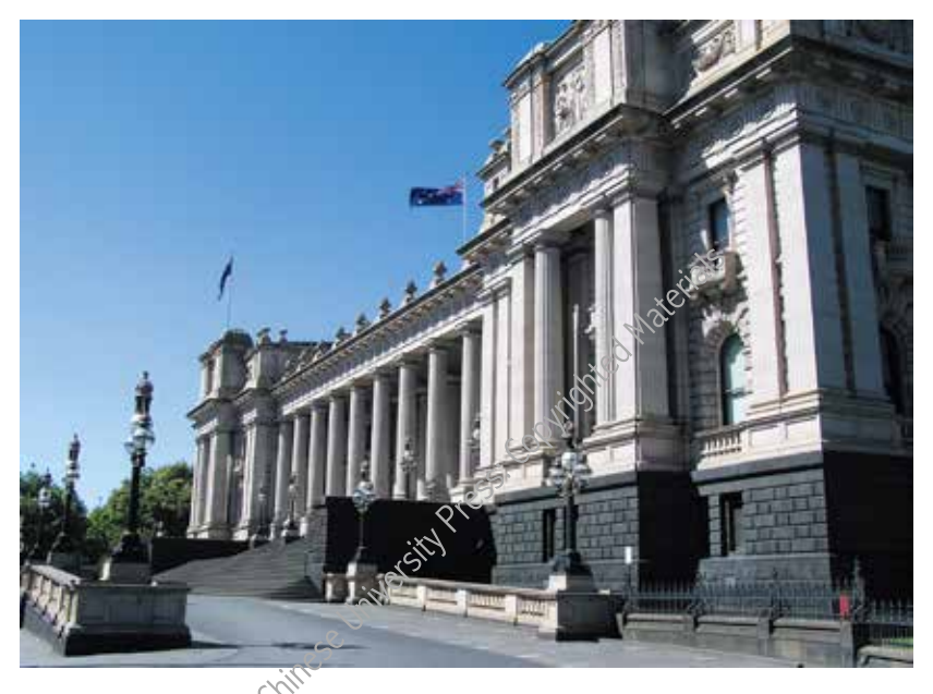
Figure 2.4 Victoria State Parliament Building in Melbourne<sup>9</sup>

the wealth acquired during the Victorian gold rush years. Over the years he would commit the elegance of the lines and grandeur of these buildings to his memory and heart. Before the end of his stay in Melbourne, he knew in his heart what he would like to be—a builder.