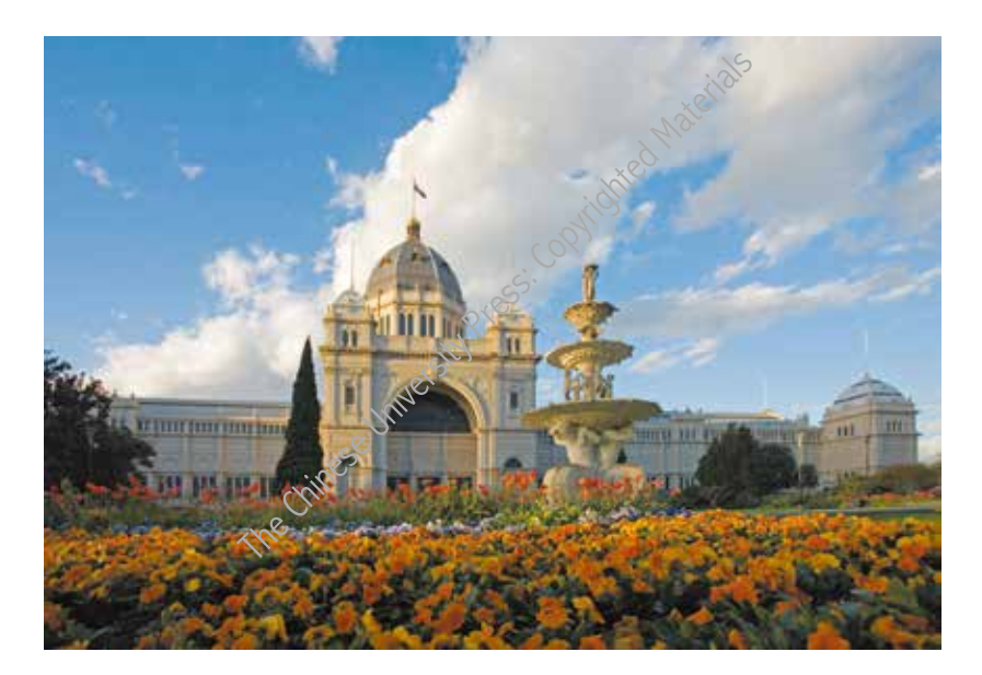
Figure 2.2 Royal Exhibition Building in Melbourne<sup>10</sup>

Lam would pause and admire another impressive building on the south of the Parliament Building—the Old Treasury Building constructed to house the state gold vaults. Built in Italian Renaissance style, this distinctive building has a very handsome exterior, with balustrades of carved freestones of balconies and graceful windows.