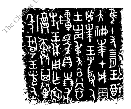
Shu Ze fangding 叔矢方鼎

Figure 5.1 Shu Ze fangding 叔矢方鼎 Inscription; after Liu Yu 劉雨 and Yan Zhibin 嚴志斌, eds., Jin chu Yin Zhou jinwen jilu er bian 近出殷周金文集 錄二編, 4 vols. (Beijing: Zhonghua shuju, 2010), vol. 1, p. 344, #320.