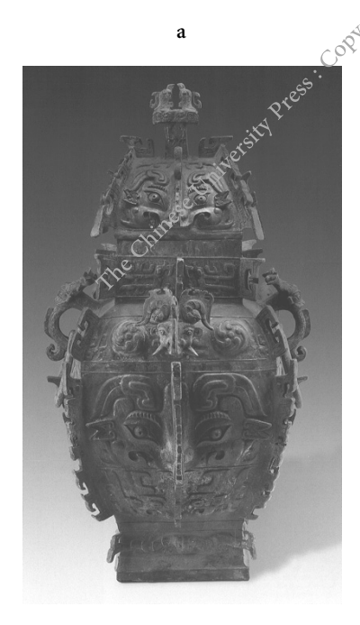
Figure 5.3a-b E Hou fangyi 噩侯方彝 Vessel and Inscription; after Suizhou shi bowuguan, ed., Suizhou chutu wenwu jingcui (Beijing: Wenwu chubanshe, 2009), pp. 30–31, #35.

three truly extraordinary pieces: a zun 尊-vase, a you 卣-bucket and a fangyi 方彝-square casket with matching animal mask décor.<sup>19</sup> Although the inscriptions on the pieces are simple, that on the fangyi does indicate that they were made for a Lord of E 噩侯 (Figure 5.3a–b), apparently indicating that this state was originally located in this vicinity.<sup>20</sup> As we will see later in this survey, the seat of the state of E subsequently moved some 150 km up the Han River 漢水 drainage to the vicinity of present-day Nanyang 南陽, Henan, whence it was involved in some of the most momentous events in the history of the late Western Zhou reign of Zhou Li Wang 周厲 王. The Yangzishan bronzes show that the history of this Ji 姞-surnamed state went back at least to the beginning of the Western Zhou; when the report on this discovery is eventually issued, it will surely attract great scholarly attention.