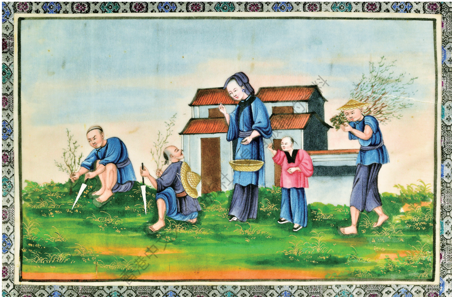
種茶苗 Planting seedlings