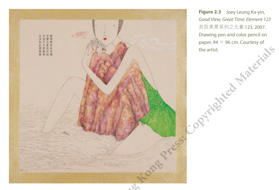
Figure 2.3 Joey Leung Ka-yin, Good View, Great Time: Element 123 良辰美景系列之元素 123, 2007. Drawing pen and color pencil on paper, 94 imes 96 cm. Courtesy of

2000s, a medium she used to such interesting effects that I analyzed them by comparing them with the idea of Superflatness advocated by Takashi Murakami 村上隆 (born 1962), certainly the most famous contemporary artist who explored the limits between the high art of painting (or at least objects reminiscent of painting) and the low art of comic books (this too is not the main topic of this chapter, but just as "East" and "West" are always problematic, so of course are "high" and "low" when it comes to art). However, where the Japanese artist advocated a form of neutral cultural artefact, where the cultural origins of an artwork are somehow erased by the commercial veneer applied to it, it was clear that Joey Leung was pursuing, in all her works, an exploration of her own roots as a Hong Kong artist. Her belonging to the