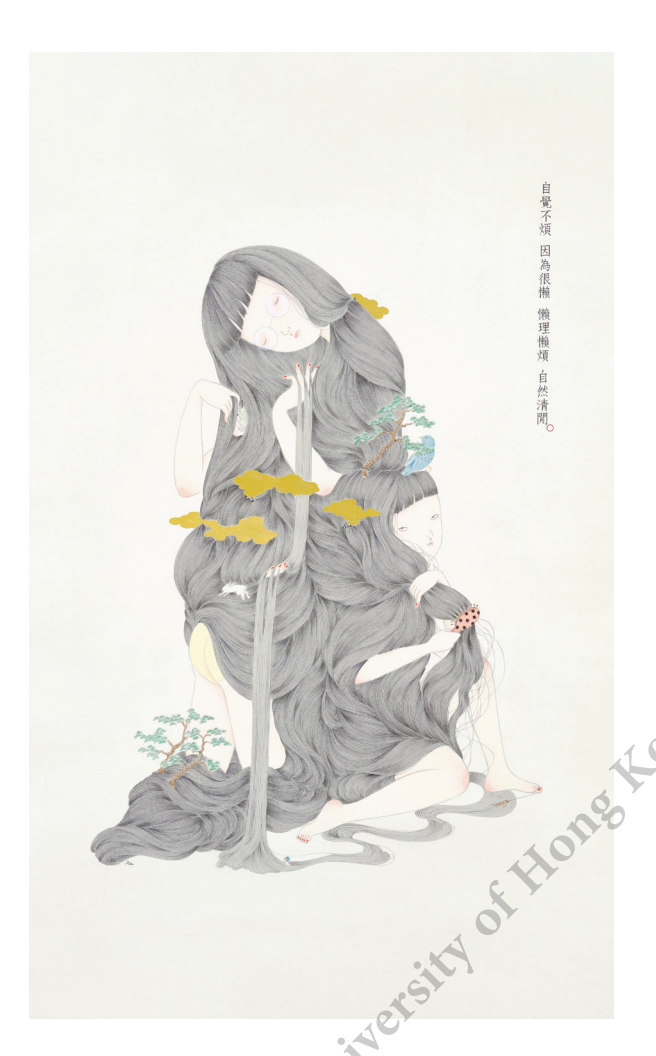
Figure 2.5 Joey Leung Ka-yin, The Carefree Stone 不煩石, 2018. Ball pen, acrylic, gouache, Chinese ink, color pencil on paper, 85 \times 50 cm.

young and seemingly emotionless, are all contained within an undifferentiated mass of hair, making it impossible to identify whose hair viewers are looking at when beholding the painting. Once the viewers have seen the general layout of the painting, they start realizing that they are in the presence of giantesses. Within the mass of hair, other characters and objects appear: a pair of gnarled trees, a minuscule