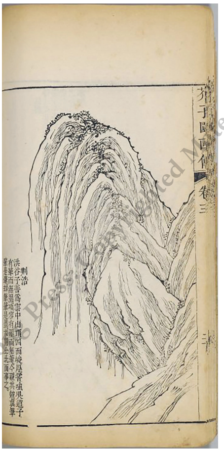
Figure 2.4 Examples of various surface strokes used to shape rocks, with "hemp fiber brushstroke" (pimacun 披麻皴) on the top rock (left), and of those used to shape a mountain face in the works of Jing Hao 荊浩 (c. 885–915) (right). Two pages from the Mustard Seed Garden Painting Manual 芥舟學畫編,1782. Woodblock printed book, ink and color on paper, each 29.8 × 17.3 cm. Brooklyn Museum, Gift of Reverend J. J. Banbury, 05.583.

to form natural formations such as rocks and plants. One of the most commonly used of such brush-strokes for rocks and mountains is, for instance, the "hemp fibre brushstroke" (pimacun 披麻皴), sometimes applied with fairly dry ink as in these examples from the famous Mustard Seed Garden Painting Manual 芥舟學畫編 (Figure 2.4). One painting from the series exemplifies perfectly how the hair of