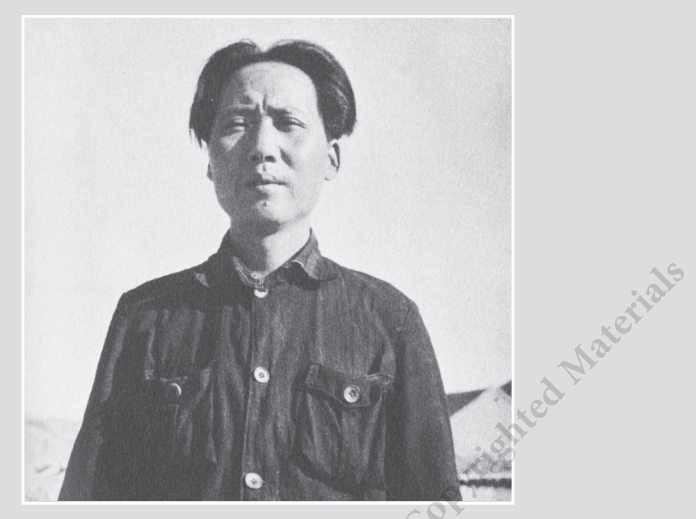
Figure 5. Mao Zedong in a photo taken by Snow