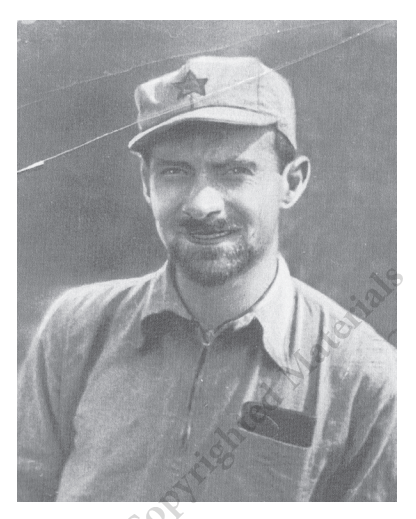
Figure 4. Edgar Snow during his investigative reporting in northern Shaanxi

In order to collect information on the Communist Party's activities and its leaders, both wrapped in mystery, in the summer of 1936, Snow succeeded in making his way from Xi'an to enter "red China," the revolutionary base area in northern Shaanxi Province. He was permitted to gather information for three months, and during that time he not only took photographs of the leaders of the Communist Party from Mao on down, but also was fortunate enough to extract an autobiography