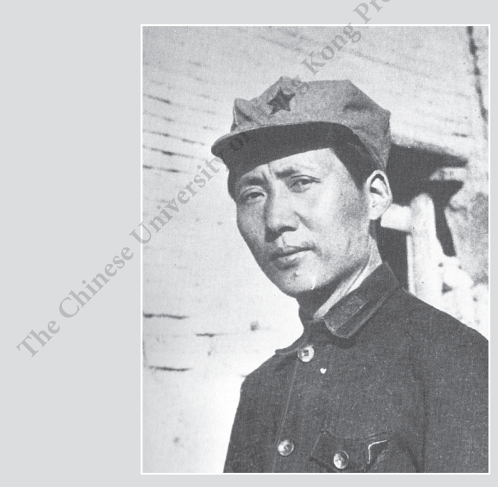
Figure 6. Mao Zedong in a photo