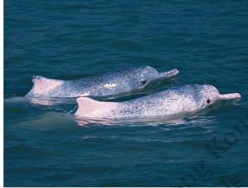
Figure 1. Chinese White Dolphin.

result of the blood flushing near their skin, which helps release heat (HKDCS). The Chinese white dolphin in Hong Kong belongs to “part of a large population (> 2,000 individuals) that inhabits the Pearl River Estuary” (Jefferson 771), meaning that the dolphins can swim freely across the border instead of only residing in the Hong Kong waters. As indicated by the other name “Indo-Pacific humpback dolphins,” the dolphin can also be found from “central China southward throughout Southeast Asia and westward to the Bay of Bengal” (IUCN).